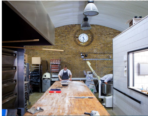
Fabrique Bakery, Hackney