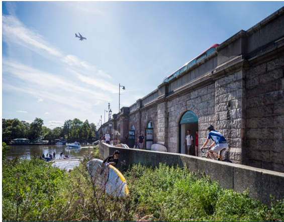
Kew Bridge Arches

community and for the future. We are helping to shape London, and we are determined to leave a legacy of quality, sustainable design, partnership and positivity that benefits millions of Londoners.