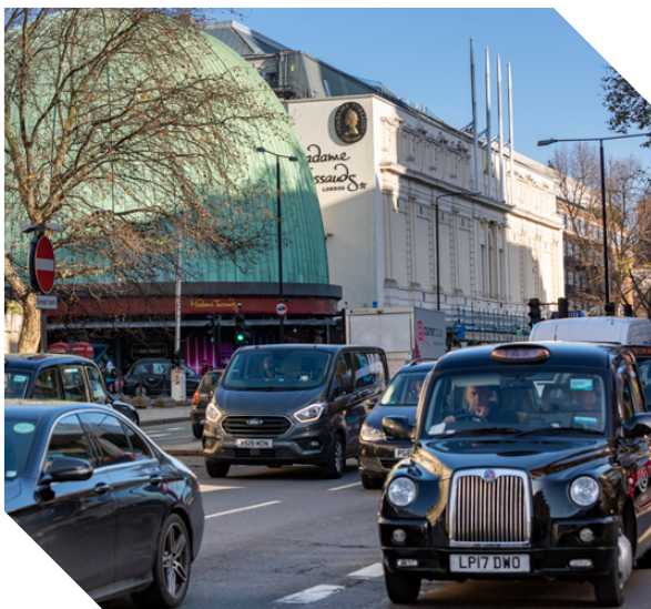
Madame Tussauds, Marylebone Road

The area's appeal extends to tourists and students alike, thanks to its proximity to iconic landmarks and the University of Westminster campus. While Marylebone High Street caters more to local shoppers, Baker Street leans towards tourist-focused retail and leisure . This includes casual dining options, pubs and popular chain restaurants such as Wetherspoons, The Globe, Pizza Express, Nando's and Five Guys.