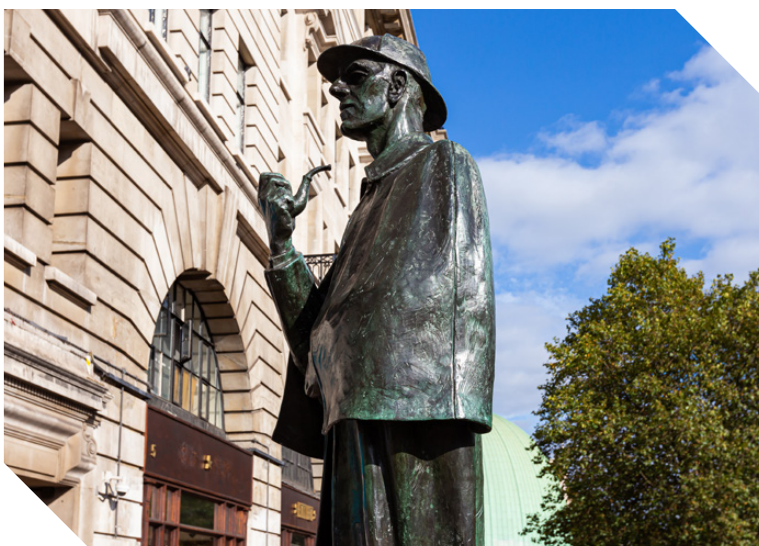
Sherlock Holmes Statue