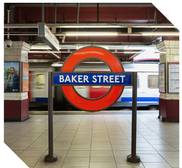
Baker Street Underground