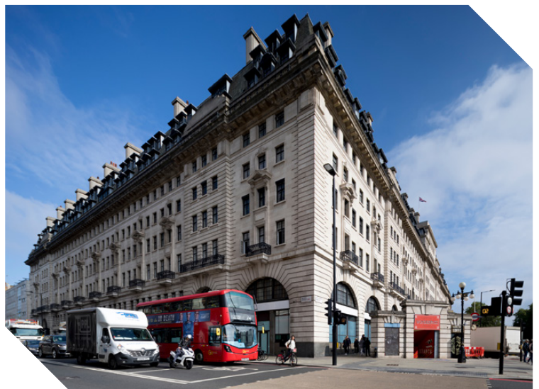
On the corner of Baker Street